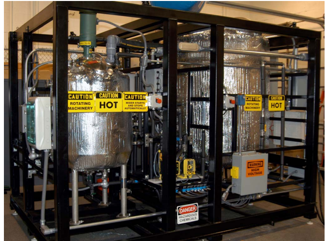
Biological waste treatment system

DEI has developed a number of its own patented chemical processes, and also assists utilities by performing independent qualifications of processes developed by others. Drawing from our materials and environmental expertise, we help utilities ensure that these processes are applied without exceeding corrosion allowances for the nuclear components being cleaned, and we also assist utilities in developing and qualifying processes to manage the contaminated resins and liquid waste from these cleaning applications.