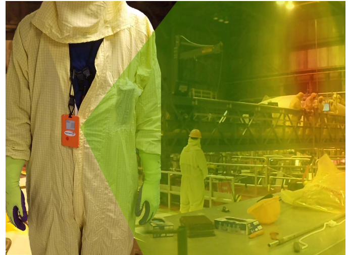
Worker donning Telepath™ tracking device

This passive approach reduces the cost, labor and exposure associated with generating routine radiation surveys. Frequency-based surveys may also be eliminated through continuous monitoring using the Telepath™ system.