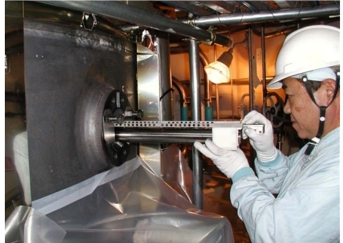
Insertion of ultrasonic transducers and delivery tooling into SG access port