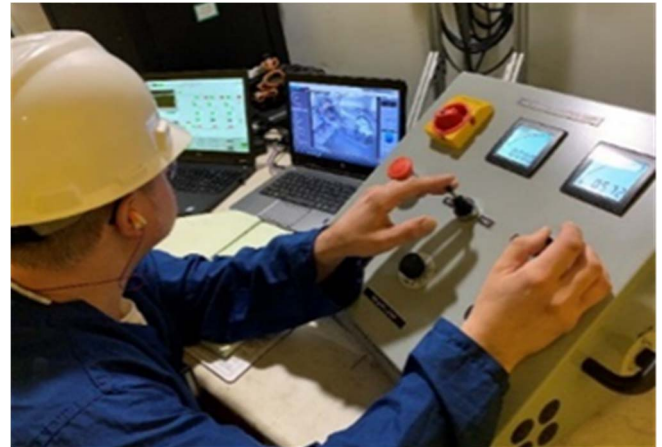
DARVA™ deployment at US BWR