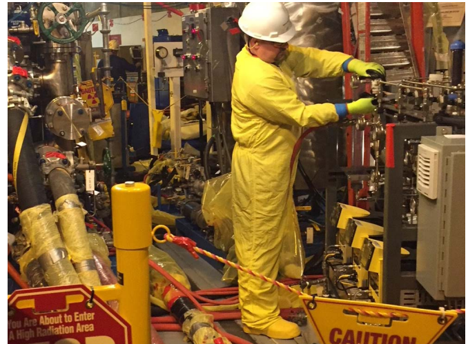
LT-ZiP™ application at US BWR